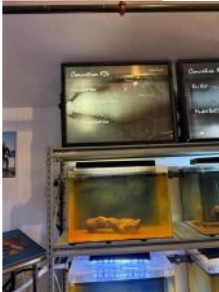
Concretion Display, Whydah Pirate Museum